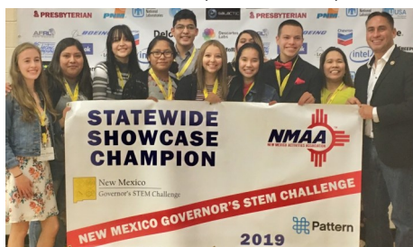
2019 BHS STEM Team and Educator with Lt. Gov. Morales