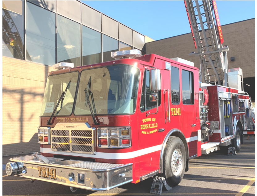
New Ladder Truck for the Bernalillo Fire/Rescue Department

We are awaiting final documentation for the following 2021 funded projects: